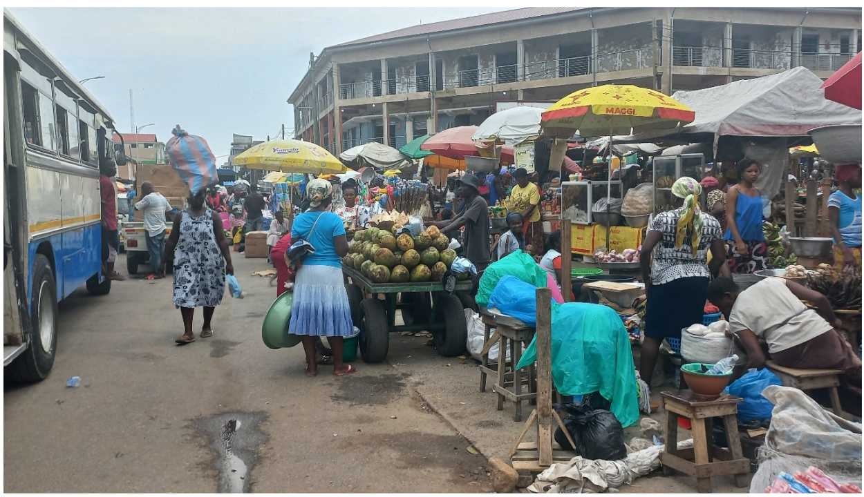
Fig. 3: Guɔyɛlɔi ni miiya nɔ oyayai yɛ 31st December jara lɛ mli

De falefale – kɛtsɔ de fɔmɔ bɛ fɛɛ bɛ kɛ/aloo tsofai kɛhad Ōhand sanitizerɛ– ji gbɛ kome ni ato he gbejianƆoo ni yɛɔ omanyɛ ni haa abaa COVID – 19 kɛ tsɛɲmɔ helai srotɔi ni gbɛɔ eshwaa lɛ shi. Bɛ mli ni de falefale feemɔ he bahia yɛ bɛ mli ni COVID-19 kɔɔyɔ helai je ehia kpoAs hand hygiene became critical in the wake of the COVID-19 pandemic, jarayeli he nɔkwɛlɔi ni yɔ Accra and Kumasi masi fee nibii ni bayɛ ebua de fɔmɔ ni ji Veronica buckets – ni nu yɛ mli – ni samina nu fata he kɛ de tso fa (hand sanitizers). Nɛkɛ falefale feemɔ he nibii ni akɛhaa lɛ je ankrɔaɲkroi, blema tsemɛi anɔkwɛlɔi (traditional authorities) kɛ nitsumɔhei kpanaa (corporate institution) adeɲ. Keji nibii nɛɛ ni akɛha ta, abɛ shika jɛshɛ ni akɛ baahɛ nɛkɛ falefale feemɔ he nibii ni akɛ tsuɔ nii yɛ jarayeli hei nɛɛ. Agbɛnɛ hu akɛ guɔyɛlɔi efeko gbejianƆoo ko ni abaaha amɛ falefale feemɔ he nibii nɛɛ ni amɛkɛ tsuɔ nii yɛ jara lɛ mli. Shwapo awalɔi, nii terelɔi kɛ trɔke tsilɔi hu nuu he akɛ esani amɛkɛ nu awo Veronica buckets bei fɛɛ bei. Kɛfata he hu, de fɔmɔ gbejianƆoo, yɛ bei pii amlɔi, ba shi yɛ otsi fioo komɛi asɛɛ ni nyiɛ ekɛnitsumɔ yɛ jarayeli hei ni yɔ Accra kɛ Kumasi.