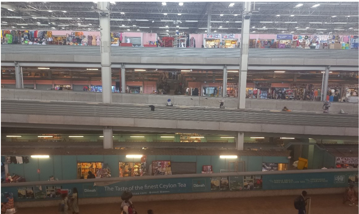
Fig. 4: Ijwɛitsu ni ahɔɔ nibii srɔtoɔ yɛ mli yɛ Kejetia jara ni yɔɔ Kumasi tɛɲ lɛ

waa, esani nɔkwɛlɔi abɔ mɔdɛɲ ni eha mɔfɛɛ mɔ aɲmala woji ni amɛkɛ ha, titrii lɛ nitsumɔ bibii kɛ ewuji fɛɛ, ni atsu he nii ni aha amɛ shika pɛpɛɛpɛ. Nitsumɔi ni yɔ Ghana, my babaoɔ ji mɛi ni kɛ nibii haa ni ahɔɔ yɛ jarayɛli hei, ni amɛ baanye amɛfee pii kɛtsɔ nitsumɔ lɛ sɔ ni ka amɛnɔ yɛ amɛkɛ shramɔ mli yɛ ekolɛ nibii ni amɛ kɛ baaha guɔyɛlɔi aloo ni amɛ baa tɛɛ nibii anɔ aloo ni amɛ baafi (anɔkwayɛli) guɔyɛlɔi asɛɛ kɛ heyɛli shika bɛ mli ni kɔɔyɔ hela ba. Guɔyɛlɔi akuu baanye hu ni amɛfi amɛ kuu mli bii asɛɛ kɛtsɔ shika ni ato kɛha mɛi ayɛli kɛ buamɔ nɔ.