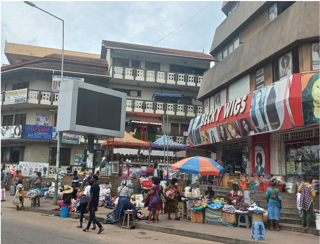
Fig. 2: Makola Shopping Mall hiɛ.

Ye nɛke akpo kuku nɛɛ mli le wɔ hara niamlitaomɔ ni kɔɔ he tɛɛ ke eba akpo gbetsiinii ye jarayali hei nɛɛ. Klɛɲklɛɲ fa le tsɔɔ nagbai komei ni kɔɔ tɛɛɛmɔ hela kudumɔ gbetsiinii ke nitsumɔ ni ake kpe ye jaji etɛ niamlipeimɔ ni yɔɔ Kumasi ke Accra. Nii ashishi numɔ kpakpa ni kɔɔ gbetsiinii pɔtɛ nɛɛ he le haa aleɔ gbɛi ni esaake ako ketsu wɔsɛɛ saji ahe nii. Nɔni ji enyɔ le jeɔ ɲaawoo etɛ ni atsɔɔ nɔ anaa hiɛyaa ye kɔɔyɔɔ hela hewalɛwoo ye jarayali hei le akpo.